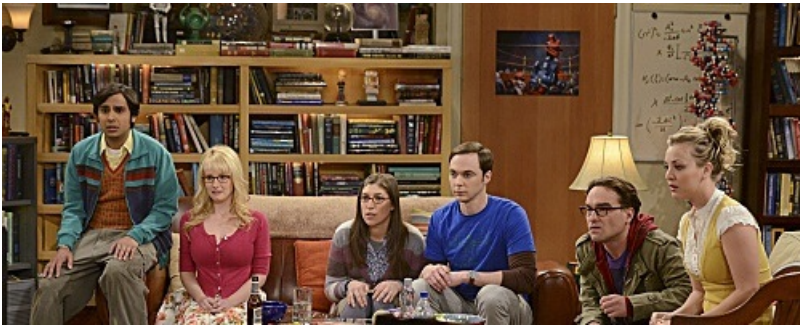
5 Name of TV show please: _____