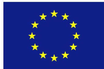
15 Organisation name _____